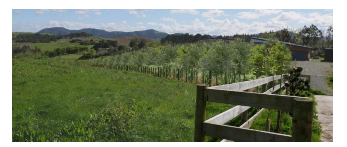
Figure 6: Proposal with planting at five years growth (Landscape Memo 6th October 2021)