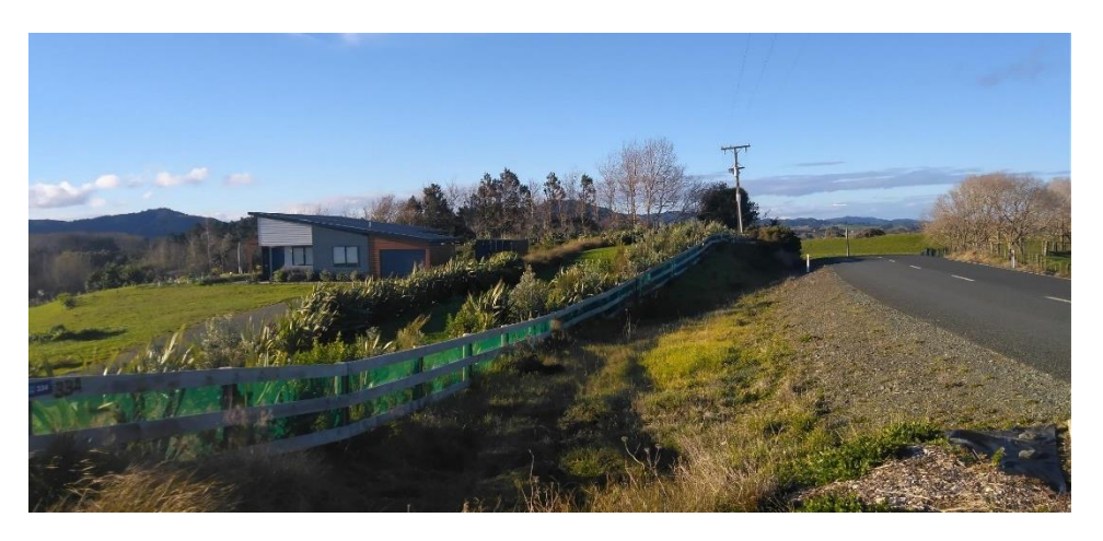
Figure 2: View of front boundary facing north.

17. The site is accessed from Oneriri Road via a shared vehicle crossing and small right of way with the adjoining lot, Lot 1 DP 533557, directly to the south. A gravel accessway leads to the existing dwelling, which sits level with the road. Between the existing driveway and Oneriri Road there is existing amenity planting, which was established through the subdivision in 2020. The area of planting at the southern-most end of the front boundary sits below both the road and the driveway and currently does not provide any screening to the existing dwelling. A rise in topography at the northern end of the front boundary lifts the existing planting to provide some visual buffering for the building.