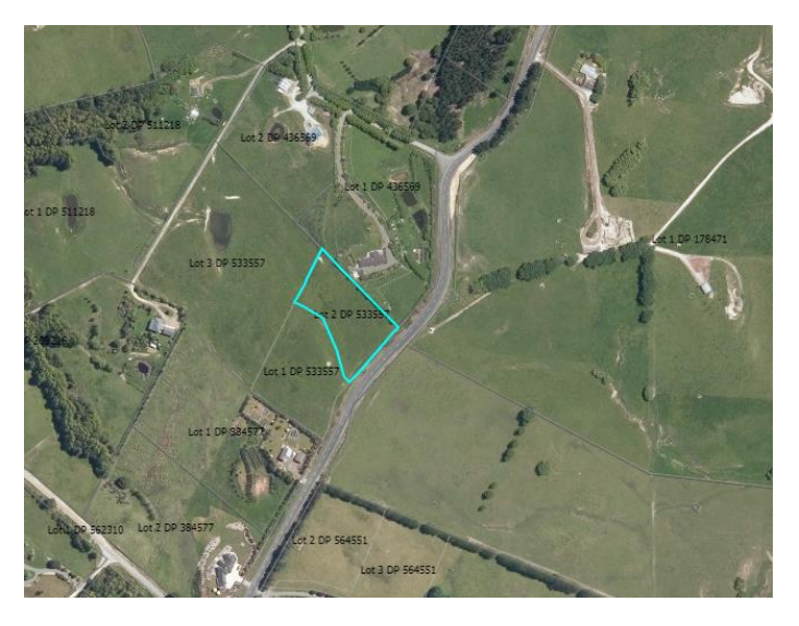
Figure 1: Site and surrounding Environment.

16. The site is zoned rural and is located approximately 3km west of Kaiwaka in a predominantly rural environment.